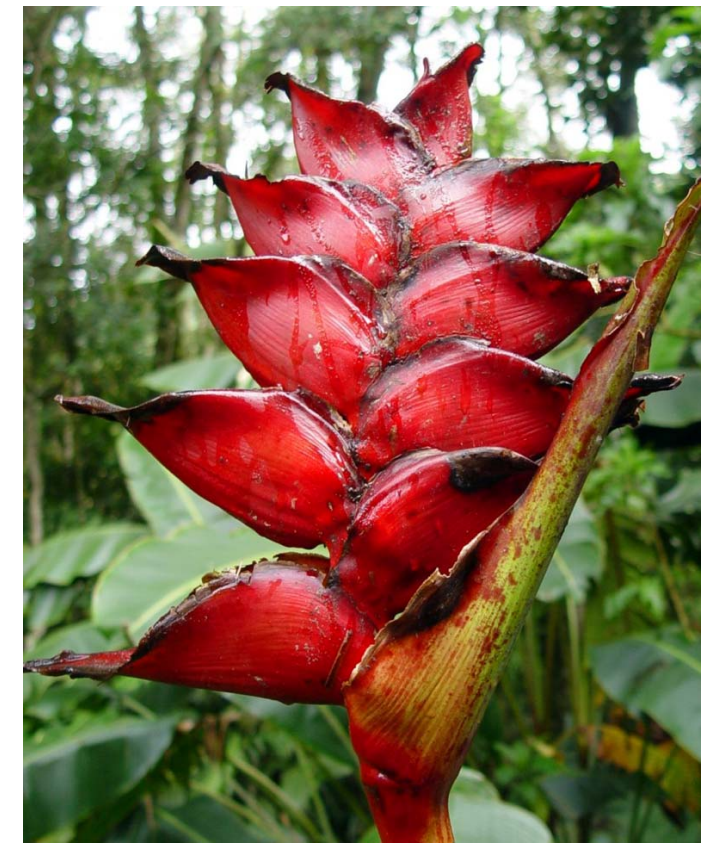
Heliconia sp. 'Rojona'

Calathea burle-marxii 'Blue Ice', Musa coccinia, white Alpinia purpurata, and many different kinds of bromeli-