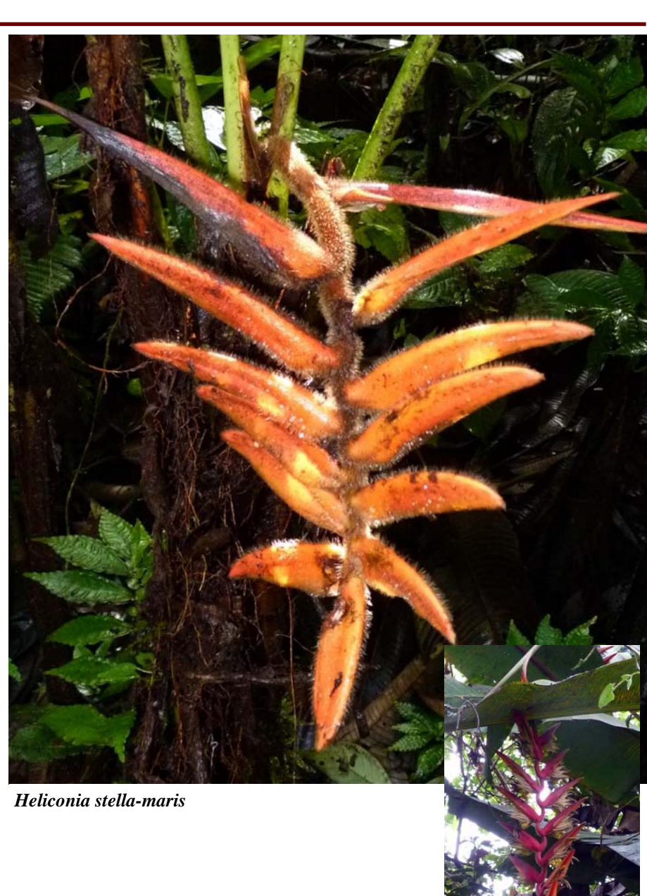
Red form of Heliconia griggsiana.