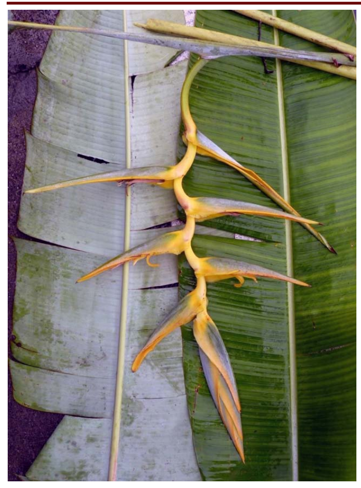
A beautiful green and gold form of Heliconia griggsiana.