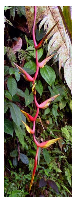
Heliconia spiralis 'Anchicayá'