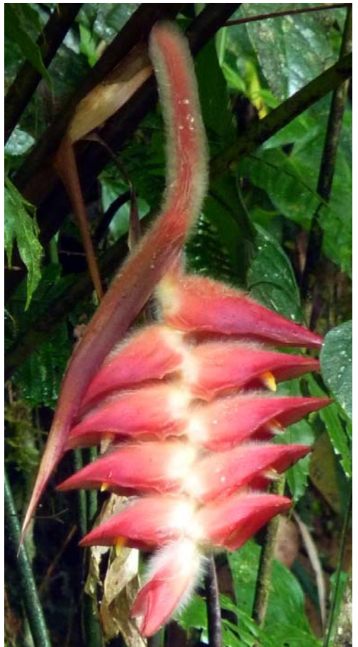
Unidentified Heliconia sp.

Panamá, Colombia, and others). She has collected many heliconias in the wild, and has made tremendous contributions to the genre by cultivat-