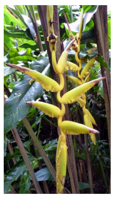
Unidentified Heliconia sp.