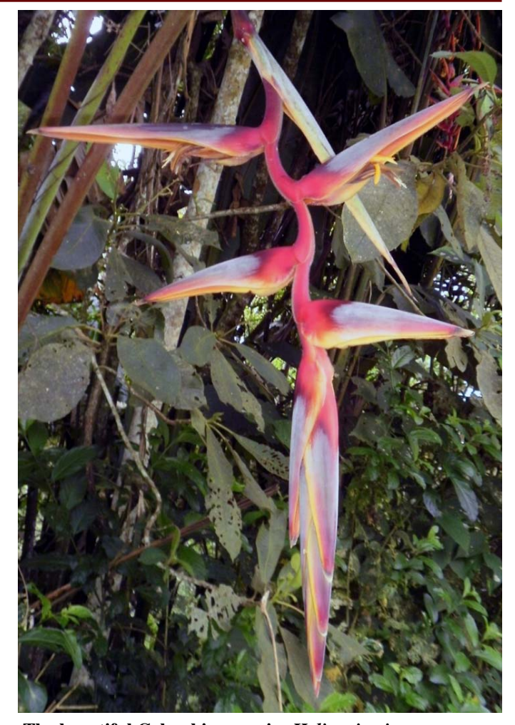
The beautiful Colombian species Heliconia gigantea.